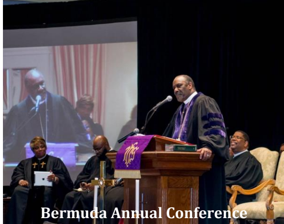
Bermuda Annual Conference