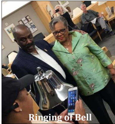
Ring of Bell

And so, my memory of what God is able to do kept me pressing forward when he was diagnosed again with prostate cancer.